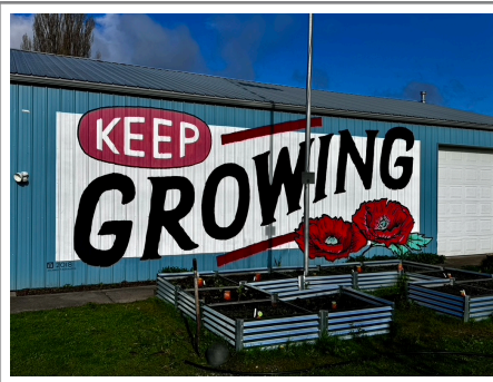
Outreach presentation to Growing Veterans in Lynden, WA (11Apr25)